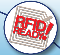
RFID Designed Printer