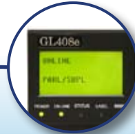
Large LCD Display Panel